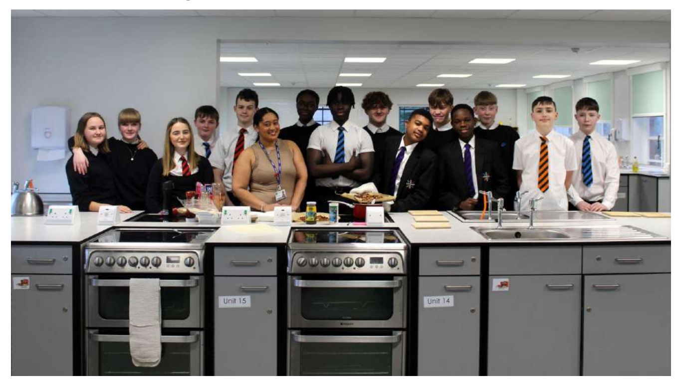
Taste of the Caribbean Comes to Risedale School Lunchtimes!

Calling all Year 9 foodies! Are you ready to explore the vibrant flavours and exciting dishes of the Caribbean? Look no further than the brand new Caribbean Cooking Club, launched this term at Risedale School!