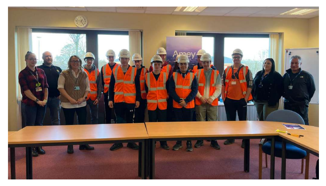
For more Careers Education Information Advice Guidance (CEIAG) please visit our dedicated website page: <u>Careers</u>.

This collaborative effort between Risedale School and Amey showcases the positive impact of engaging young minds in practical, real-world learning experiences. It not only ignites their passion for green careers but also equips them with the necessary skills to become the eco-warriors of tomorrow.